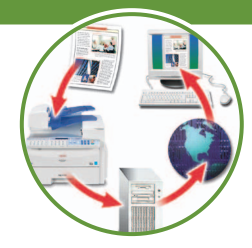
Color Scan-to-Email offers a secure, paperless way to deliver virtually any scanned document—including color photos, brochures, maps and plans.